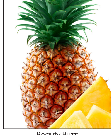
Beauty Buzz: Pineapple Extract

Most folks know that pineapple is good for you, but do you also know that it is packed with complexion-boosting enzymes? Used topically, pineapple extract sloughs away dead skin cells and polishes the surface to a smooth, fresh and luscious finish. Look for pineapple extract in Rhonda Allison's Derma Peel—an NLI client fave.