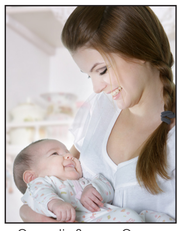
Cosmetic Surgery Corner: Mommy Makeover

False! Though cellulite is one of the more difficult skin conditions to correct, thanks to the newest laser cellulite reduction technology—there is hope for smoother, less dimpled skin. At NLI, we use radiofrequency, infrared energy, mechanical rollers, vacuum suctions, and heat in proper combination to promote drainage and decrease fat cells. Lifestyle also plays a role. Drinking plenty of purified water and getting regular enhance treatment results..